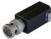
DS-1H18 Video Balun