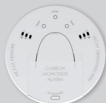
Carbon Monoxide Detector