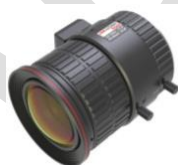
HV3816D-8MPIR 3.8 to 16 mm DC Iris