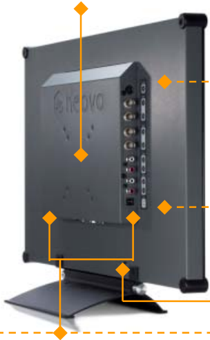
VESA Mounting Standard